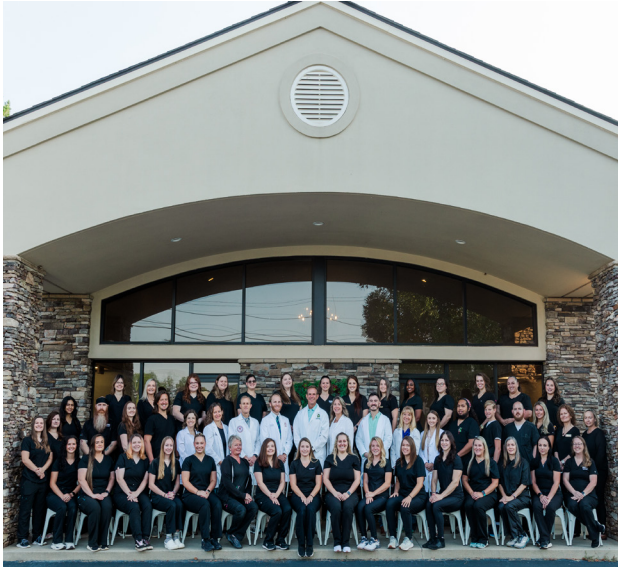
The Staff at Travelers Rest Animal Hospital